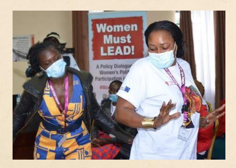
Participants dance during a session to demonstrate the importance of movement formation